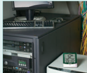
Alerts low Humidity levels in Computer rooms to help prevent electrostatic conditions.