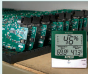
Indicates Humidity and Temperature levels in Production areas.