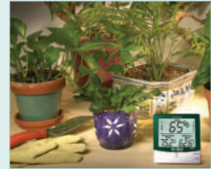
Checks the Humidity and Temperature levels for optimal plant growth in greenhouses.