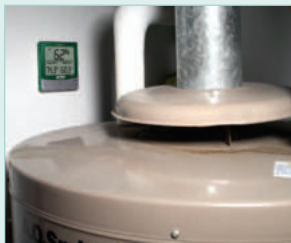
Monitoring Dew Point levels in a Basement for potential mold growth.