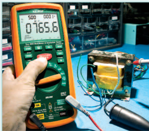
Measure the insulation resistance of transformer windings