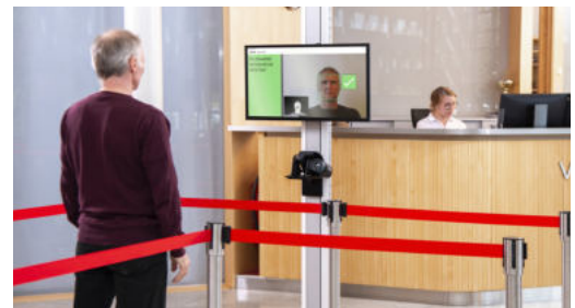
FLIR EST™ Desktop Software

FLIR Screen-EST™ Desktop is a computer screening software for FLIR T-Series, Exx-Series, and Axxx-Series thermal imaging cameras. The software deploys automatic measurement tools, like face detection and automatic average sampling, that shorten screening times of individuals to two seconds. Fast screening performance make FLIR Screen-EST Desktop the preferred solution for screening application at entries, checkpoints, and other high-traffic areas while maintaining recommended social distancing guidelines.